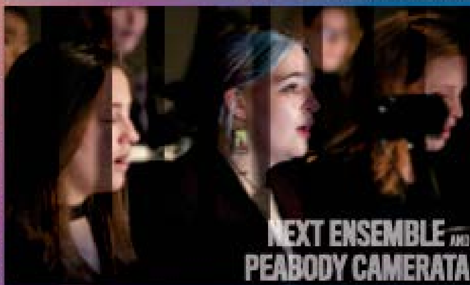
NEXT ENSEMBLE AND PEABODY CAMERATA

Peabody's FREE in-person and online performance season begins this fall, with programs from classical to contemporary, from jazz to dance.